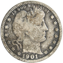
Coin 1901-P Barber 25c