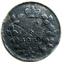
Token-Foreign Coin 1883 Canadian 5c Silver Jon Gentry