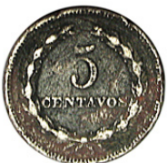
Token-Foreign Coin 1915 -5 Centavos, El Salvador Rick Razor